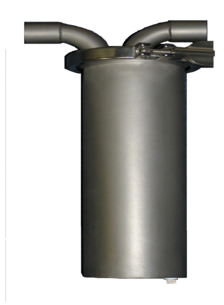
Designed for BB style cartridges

This product series is designed to accept industry standard depth and pleated cartridges that have an outside diameter of 108 mm and cartridge lengths of 10",20" or 30".