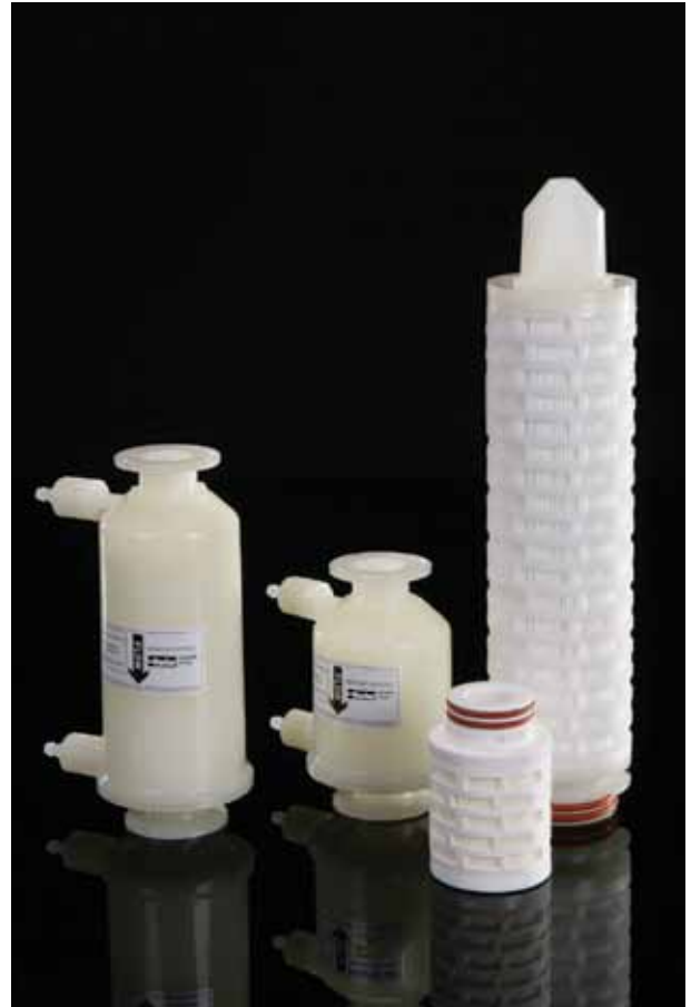
Note: BEVPOR is a registered trademark of Parker domnick hunter