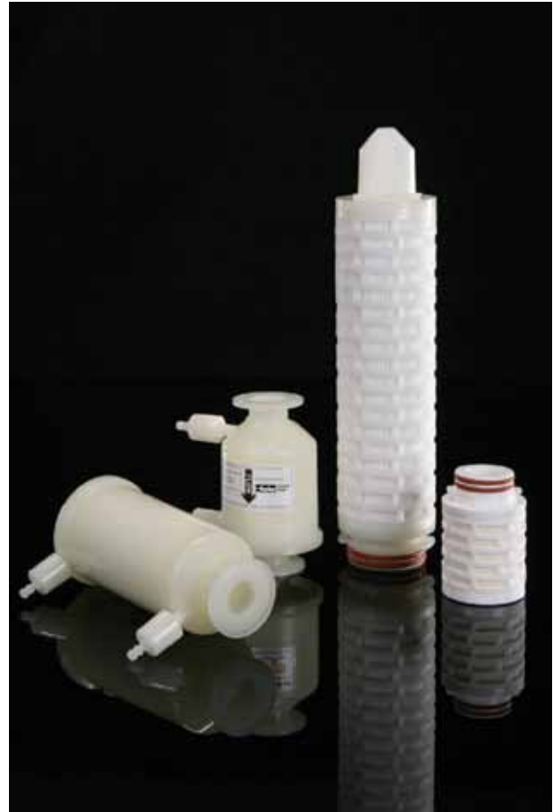
Note: BEVPOR is a registered trademark of Parker domnick hunter