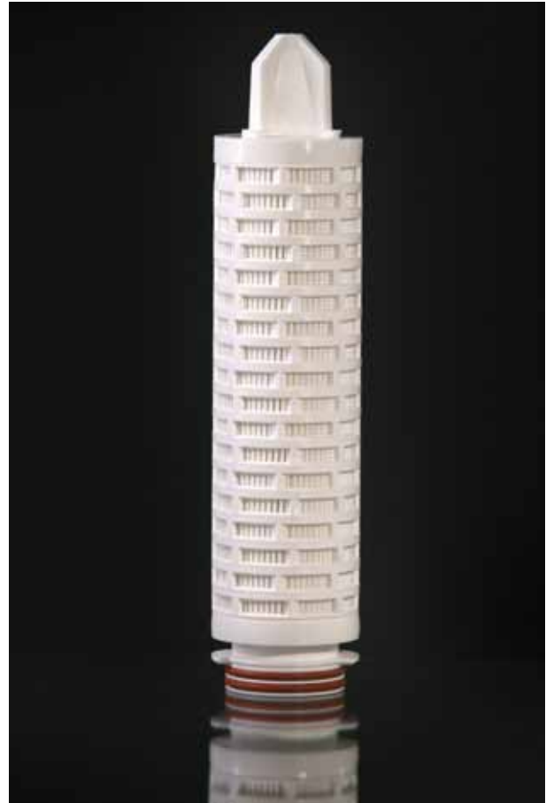
Note: TETPOR is a registered trademark of Parker domnick hunter