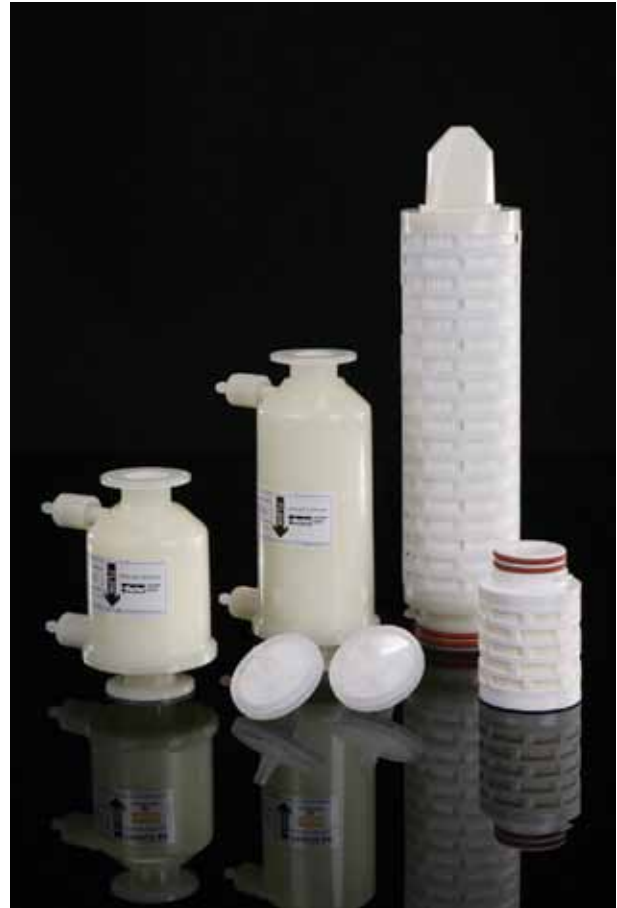
Note: PEPLYN is a registered trademark of Parker domnick hunter