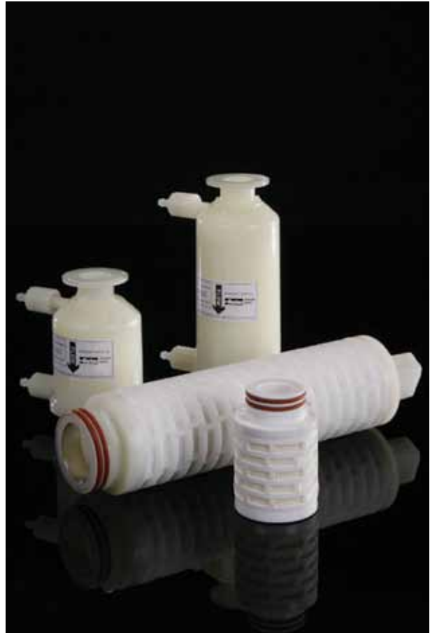
Note: PREPOR is a registered trademark of Parker domnick hunter