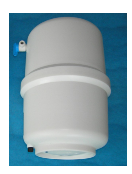
Water storage tank with valve