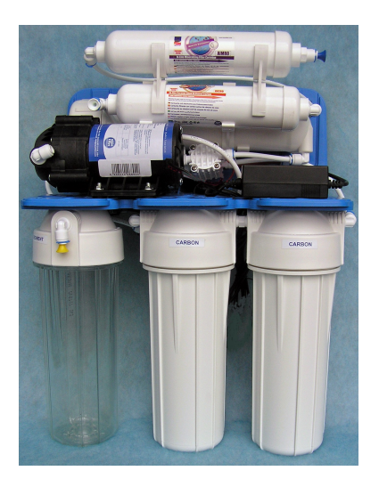
RP65139715 Reverse Osmosis