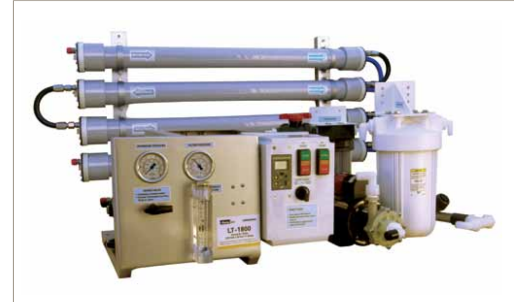
Offshore Marine LT-1800

The units feature a semi modular frame format, for installation flexibility. The frame is compact and can be above or below the water line. The boost pump and prefilters are supplied as loose items.