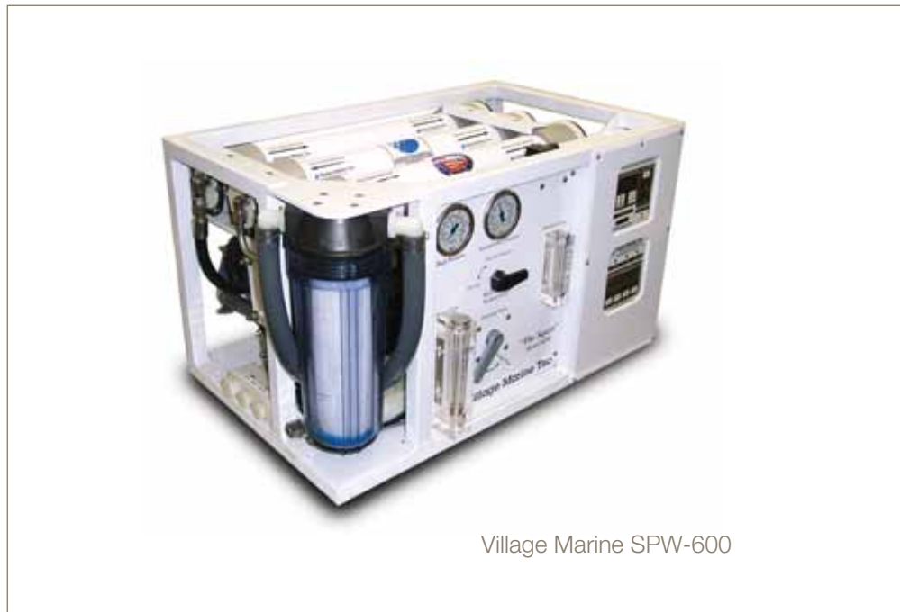
Village Marine SPW-600

The Squirt packages a full feature watermaker in a compact frame. Simple connections allow straight forward installation. The watermaker can be operated and monitored from the electronic remote control.