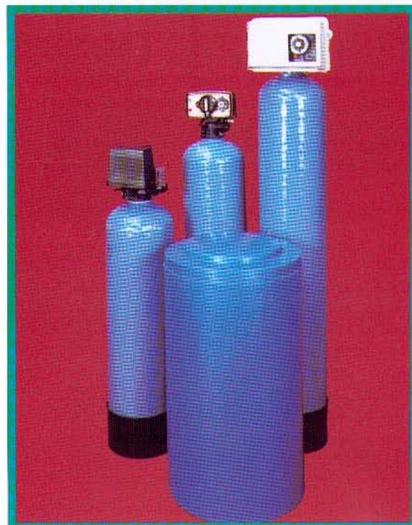
Autorol 255, Fleck 5600 and 2750 Valves illustrated.

They work by a process known as ion exchange. The hard water passes through a high quality exchange resin column inside a pressure vessel. The resin removes the calcium and magnesium ions from the solution and exchanges them for sodium ions. When the resin is about to become exhausted the softener commences the regeneration phase which is initiated by timer or volume control. The actual regeneration is achieved when the softener draws a solution of common salt - called brine - through the column of resin which displaces the captured calcium and magnesium ions and replaces them with the sodium ions in the brine. Throughout the regeneration period the unwanted ions and all the