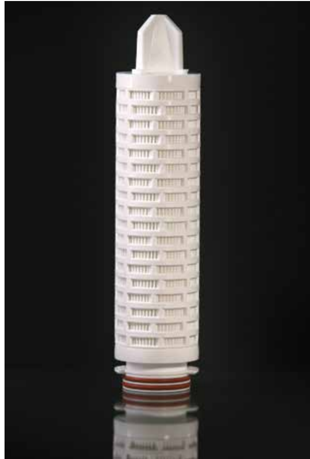
Note: PREPOR is a registered trademark of Parker Hannifin Corporation.