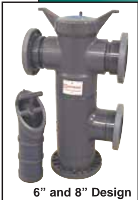
6" and 8" Design