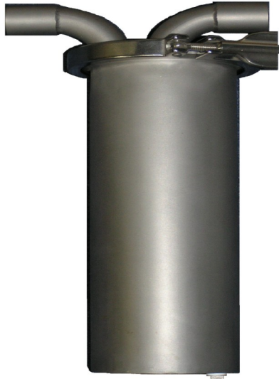
Designed for BB style cartridges

This product series is designed to accept industry standard depth and pleated cartridges that have an outside diameter of 108 mm and cartridge lengths of 10", 20" or 30".