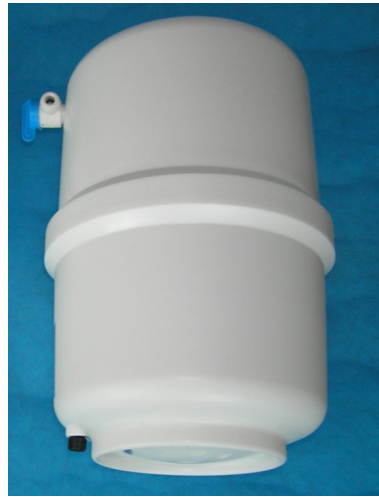
Water storage tank with valve