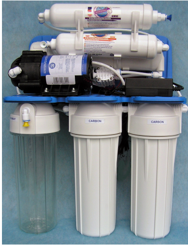
RP65139715 Reverse Osmosis