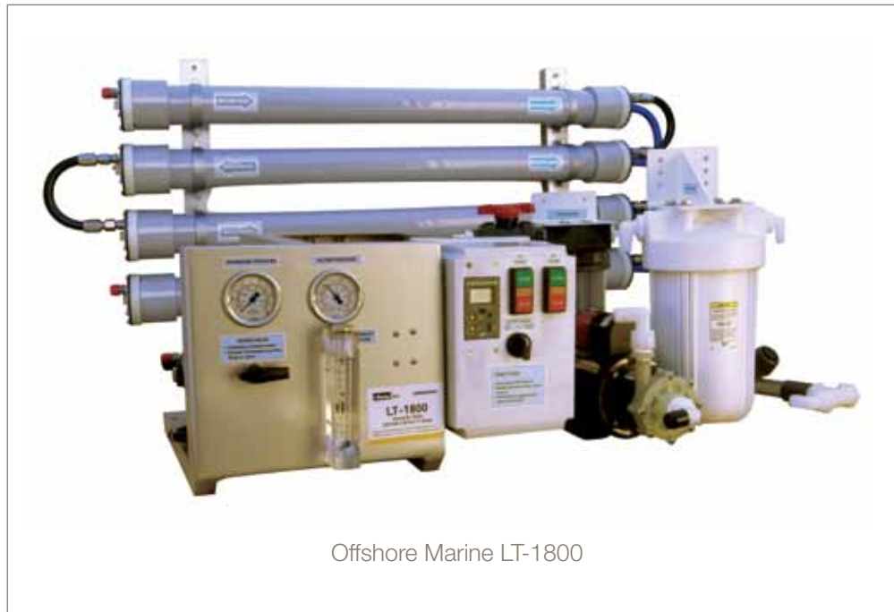
Offshore Marine LT-1800

The units feature a semi modular frame format, for installation flexibility. The frame is compact and can be above or below the water line. The boost pump and prefilters are supplied as loose items.